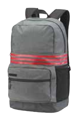
BC2242 Dark Grey Heather / Scarlet