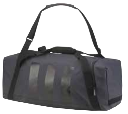
BC2246 Dark Grey / Black / Scarlet